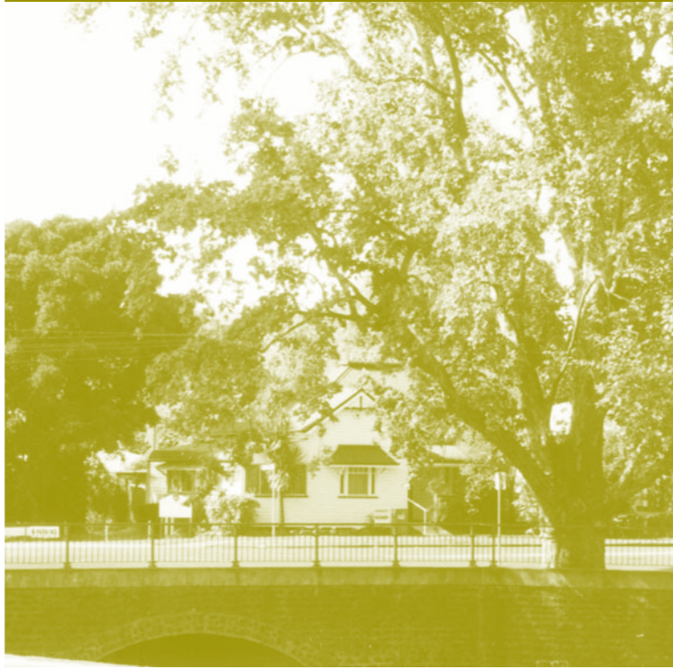
“Framed by a Sentinel” The Sentinels are explained in point 23.