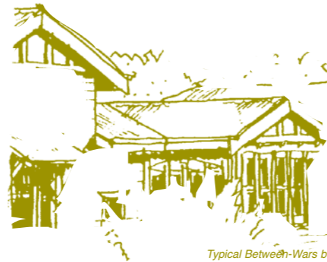
Typical Between-Wars bungalow

13 143 Mary Street, once named Maida, is a Queensland Bungalow, Style 6 in The Toowoomba House. This modest home with its gabled front is of the between wars period - the 1920s and 30s. The small verandah has been enclosed.