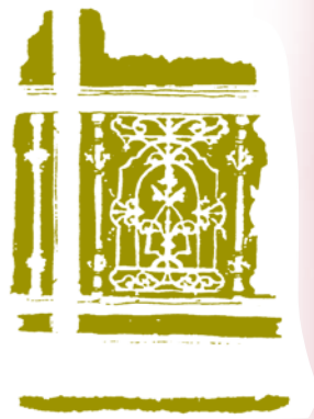
Cast iron balustrade